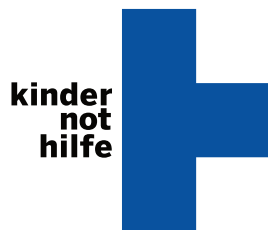
Kindernothilfe (KNH), Germany