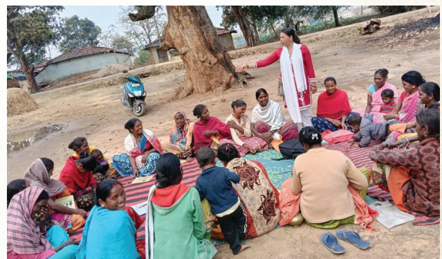
WLL module 1 training in the Village

Panchayat Level Workshop: In the district of Lohardaga, we have conducted workshops at the Panchayat level in four project panchayats. Among the 157 participants, 24 were traditional leaders, 94 were community leaders, and 39 were PRI members and panchayat workers. In all panchayats, both PRI members and customary leaders shared that major reason of