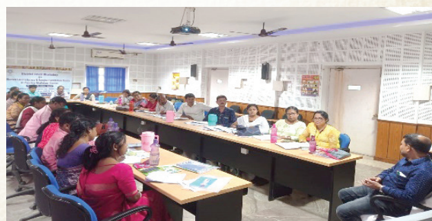
Figure 2: PD, DRDC, Paschim Medinipur interacting with the DLTs on progress of WLL and SFC