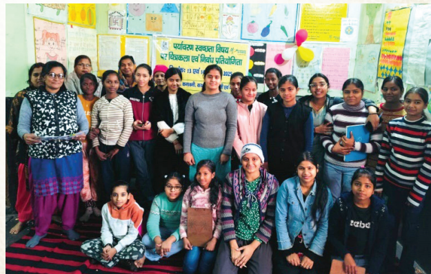
Participants of drawing program on environment

An interchange programme was organized for teachers of Balwadi centres to enhance their capacity for better organization of educational activities for children at Balwadi centres. The teachers visited the centres one by one in the month of October. They spent one entire day in visiting the centre and observed management of the centres, play way methods of teaching the children, games, sports, writing and oral activities with children, use of Teaching Learning Materials (TLMs) and overall learning environment of the centres etc.