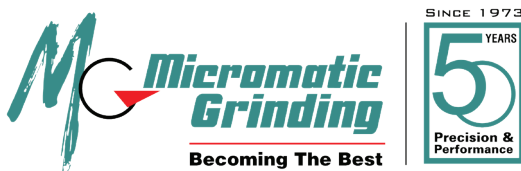
Micromatic Grinding Technologies Limited (MGT), Ghaziabad