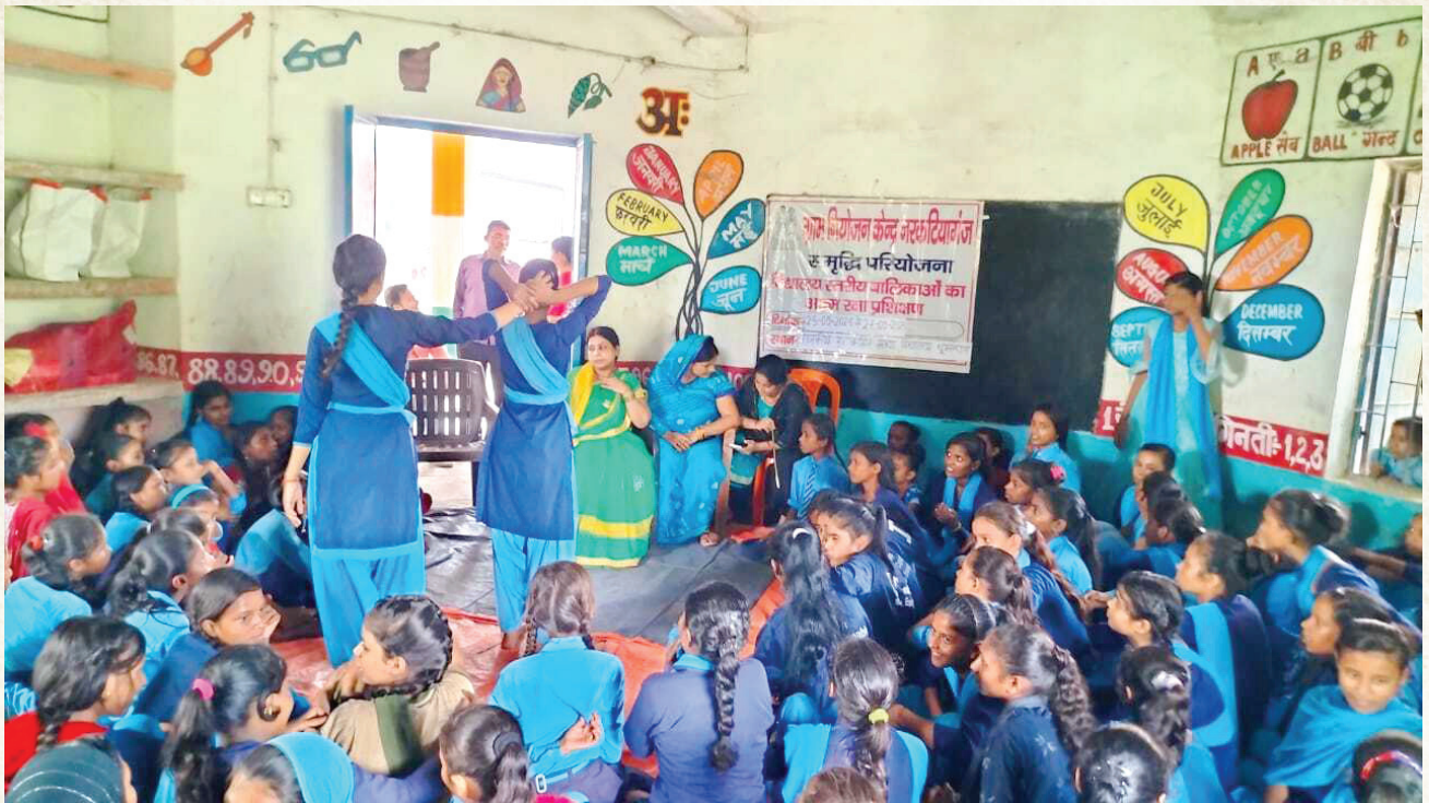
Self defence Training for Girls