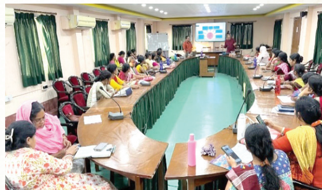
Figure 1: South 24 Parganas district organised a 2-day residential refresher training of the Service Providers & BODs of SFCs at Ramkrishna Mission, Nimpith.